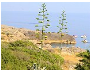
AGAVE AMERICANA/AMERICAN AGAVE (Agavaceae), bloom May – June.