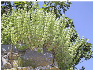
BALLOTA ORIENTALE/ORIENTAL HOREHOUND, bloom May.