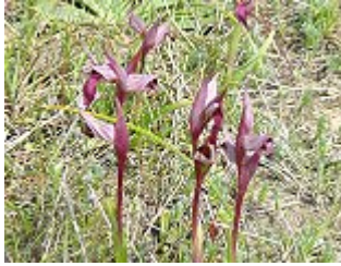
SERAPIDE LINGUA/SERAPIAS LINGUA ( Serapias lingua ), bloom March – May.