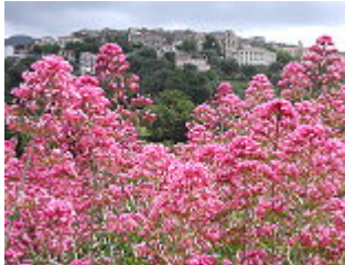
VALERIANA ROSSA/RED VALERIAN ( Centranthus ruber ), bloom April – September.