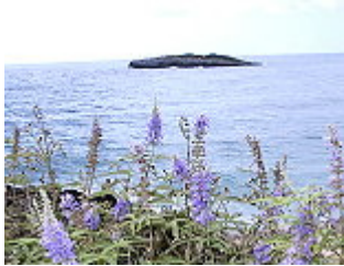
AGNO CASTO/MONK'S PEPPER ( Vitex agnus-castus ), bloom June – November.