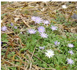
ANEMONE dell'APPENNINO/APENNINE-ANEMONE ( Anemone apennina ), bloom March – April.