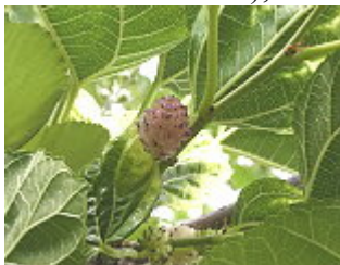
GELSO/WHITE MULBERRY ( Morus alba ), bloom April – May.