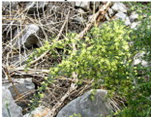
ASPARAGO PUNGENTE/LESSER ASPARAGUS ( Asparagus acutifolius ), popular delicacy, bloom July –