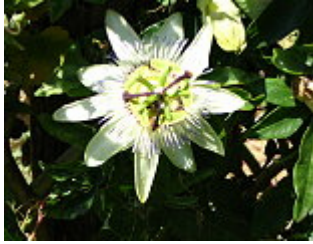
PASSIFLORA/PASSION FLOWER, bloom June.