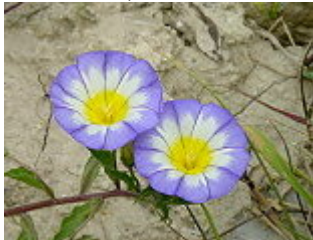
VIOLA TRICOLORE L./TRICOLOURED MORNING GLORY ( Convolvulus tricolor L.), bloom March – June.