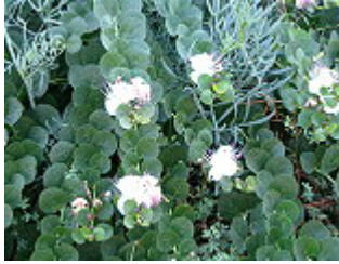
CAPPERO/CAPER ( Capparis ovata ), bloom April – September.