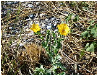
PAPAVERO CORNUTO/YELLOW HORNED-POPPY ( Glaucium flavum ), bloom April – September.