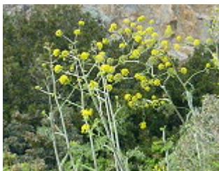
FERULA COMUNE/GIANT FENNEL ( Ferula communis ), bloom April – May.