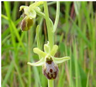
OFRIDE VERDE BRUNA/SPIDER ORCHID ( Ophrys sphegodes Miller), bloom February – June.