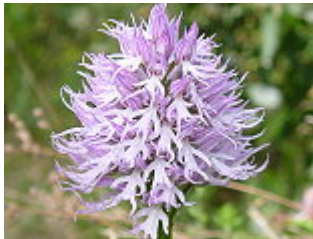
OMINI NUDI/ITALIAN ORCHID ( Orchis italica ), bloom March – May.