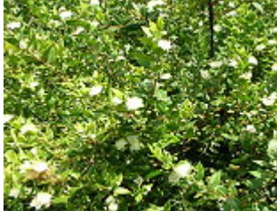
MIRTO/MYRTLE ( Myrtus communis ), bloom June – August.