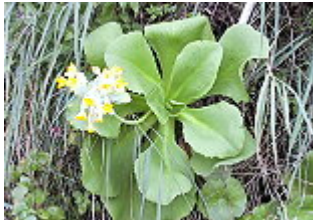
PRIMULA PALINURI/PALINURO-PRIMROSE, bloom February – March.