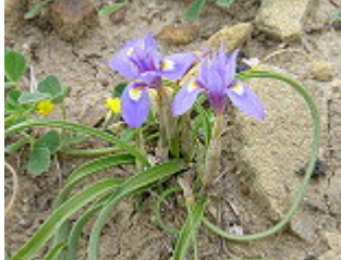
GIAGGIOLO DEI POVERETTI/BARBARY NUT IRIS ( Gynandris sisyrinchium L.), bloom March – May.