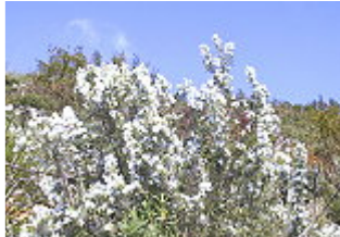
ROSMARINO/ROSMARY ( Rosmarinus officinalis ), bloom year-round.

At Cape Palinuro, which is shrouded in legend, you will find something unique: Primula palinurensis , the flower which is also the symbol of the National Park.