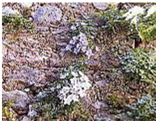
CAMPANULA FRAGILIS/BELLFLOWER, bloom starts May.