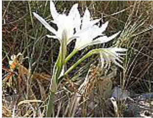
GIGLIO MARINO/SEA DAFFODIL ( Pancratium maritimum ), bloom July – September.